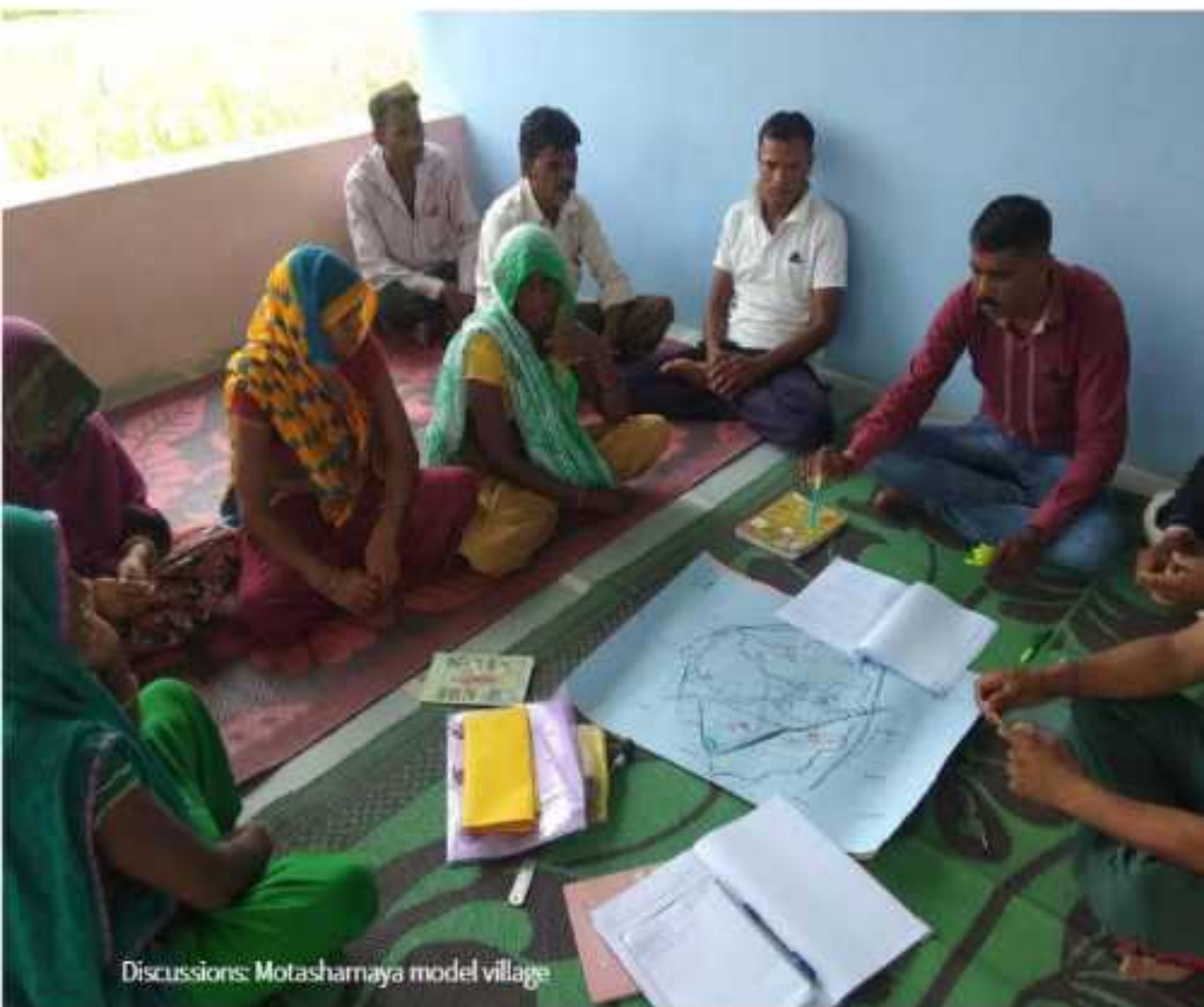
Discussions: Motashamaya model village

Women Master Farmers spread over 30 villages of 6 blocks: 929 women-master trainers gained experience through capacity building & demonstrations in various livelihood practices/innovations. This led to implementing scientific PoPs themselves. They further reached out nearly 1800 other women farmers to spread their learning/for replication. This led to better recognition of women as farmers and holders of technical knowledge by village community